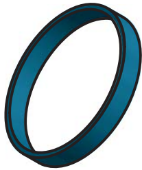
Ring-ended fabricated pipes and fittings

Shoulder-ended steel pipes, fittings and couplings to SABS 815-1