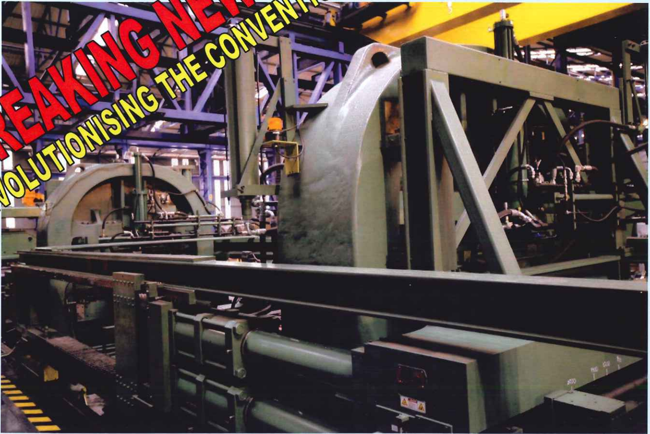
MACSTEEL STRETCHER LEVELER

BREAKING NEWS "REVOLUTIONISING THE CONVENTIONAL"